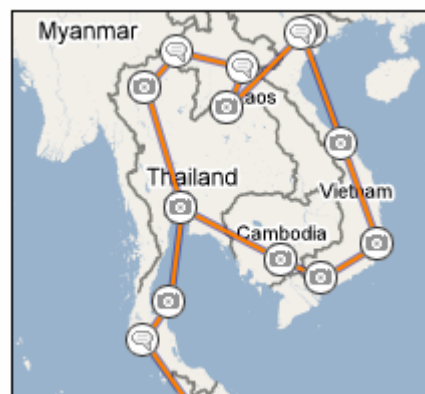
Figure 1: Travel blog showing the location of different posts and associated images

Recent photo sharing websites for bloggers such as Zoomr ( http://beta.zoomr.com/home ) and Zoto ( www.zoto.com/ ) allow users to directly enter a GeoTag inline without the need of an external service or going off-site. Visualisation of the location in a map or satellite image and showing nearby photos are standard functionality of this kind of weblog. Zoto supports uploading photos from camera phones and other mobile device via email.