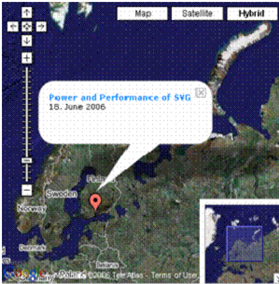
Figure 3: Example for geolocalization of a blog entry

Geotags are stored as metadata in a database table. Appropriate HTML meta tags (see section 3.3) are automatically added to the head section of the generated HTML pages where they can be evaluated by search engines or by the GeoURL service.